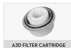
A3D FILTER CARTRIDGE