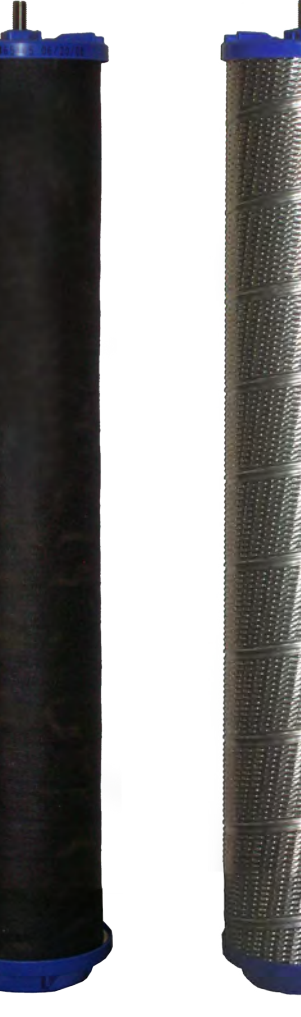
FI-644FG10TB FI-644PL1/2TB Please note: Cartridges may not look exactly like those shown in photo.